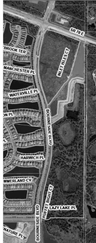
Location Map (Stillwater Project)