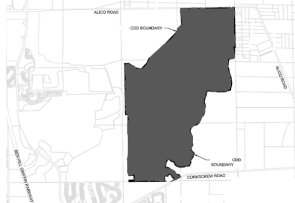
Exhibit A: Supplement #1 to the WildBlue Community Development District Master Engineer's Report, dated April 2, 2026 Exhibit B: Supplement #1 to the Master Special Assessment Methodology Report, dated April 2, 2026