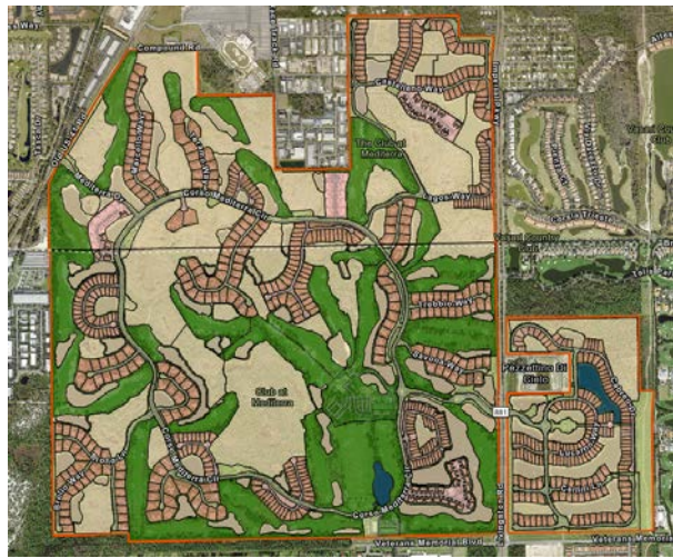
May 22, 2026