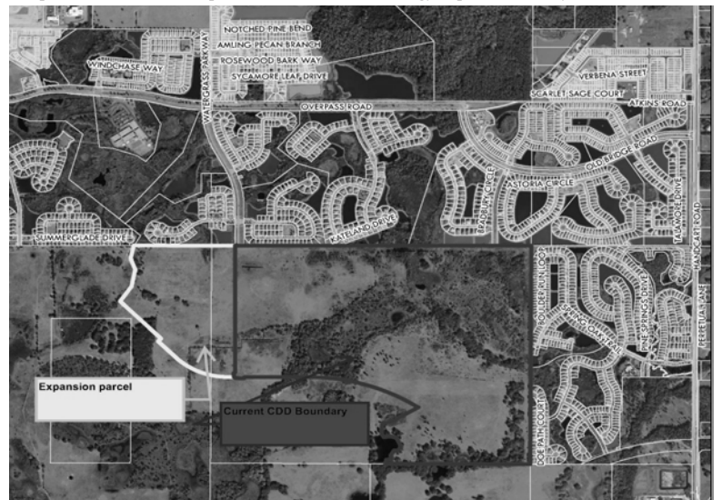
Exhibit B: B1 Expansion Parcel Master Special Assessment Methodology Report, dated May 7, 2026

Exhibit A: Amended and Restated Master Engineer's Report dated March 31, 2026